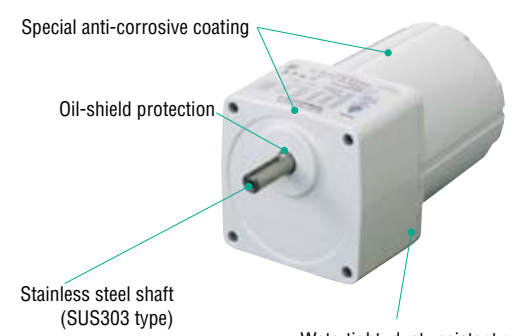
Watertight, dust-resistant geared motor O-ring employed at motor/gear case junction